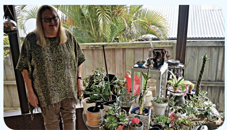
"I grow succulents. I love them. In fact I go a bit crazy with them."