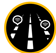
Audio tactile line marking