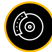
Autonomous Emergency Braking (AEB)