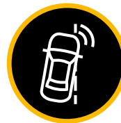
Lane Departure Warning (LDW)