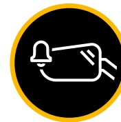
Blind spot monitor