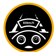
Head-up display (HUD)