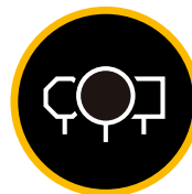
Road sign recognition