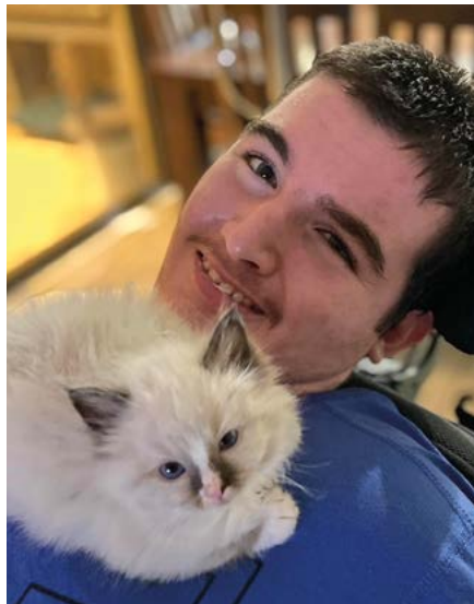
With his cat Socks.

He is inspired by nature, by trees photographed from above the canopy rather than under the branches, and by the shapes and angles laid out below of rooftops and fences. He likes to speak through his images and demonstrate his autonomy through his creativity. To be interesting and provocative. To show others things they may not notice. To reveal new angles and perspectives on the world from a drone that others haven't previously considered. To use the drone's height to show people lines, textures and colours in a new way. To encourage people to slow down and think.