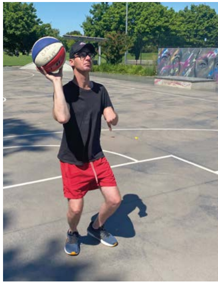
Practising his basketball.

“I still have a big team of people helping me. I really want to thank my speech therapist,