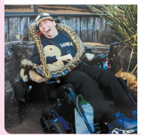
Recently, I went to Swansea. Like my snake?