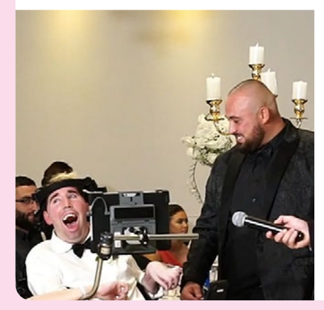
I was the best man at my brother's wedding. I even gave a speech using my eye-gaze device.