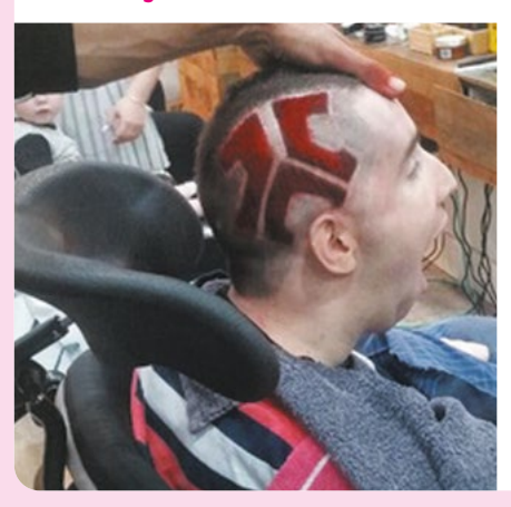
I like listening to the music. They wanted to carry my wheelchair into the moshpit!