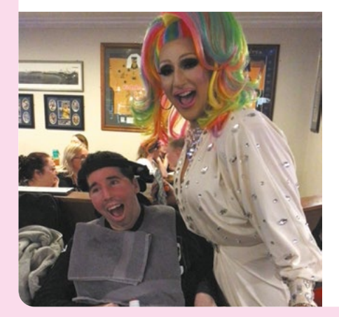
The thing is, my contagious personality has meant I have met a few stars in my time.