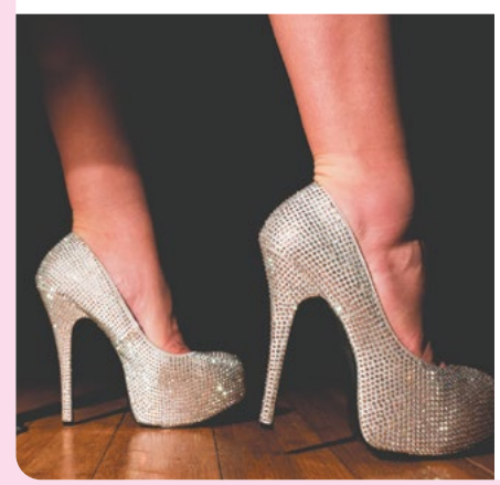
Before COVID, I used to head out to Sefton Playhouse. The topless waitresses were awesome.