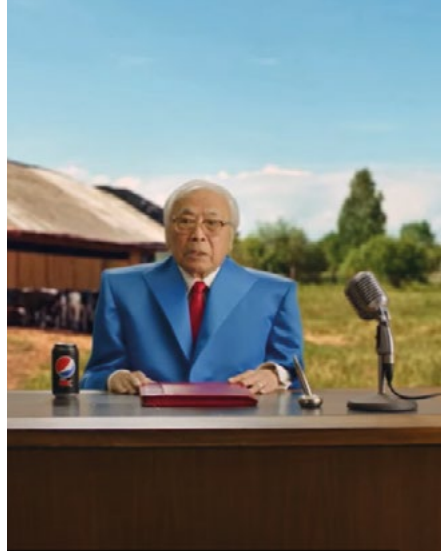
But I think things are still getting slowly better. After all, it's not a short race. It's a longdistance one.